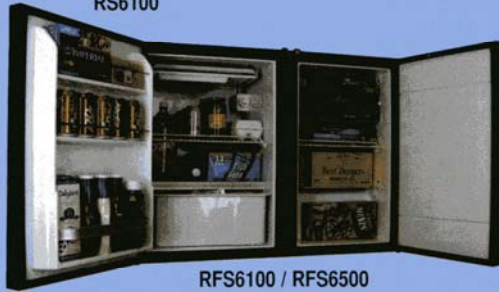
RFS6100 / RFS6500