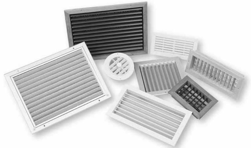
DIMENSIONS (WIDTH X HEIGHT) (2)

Note: Custom sizes and custom painted grilles are offered. Contact us for pricing and availability.