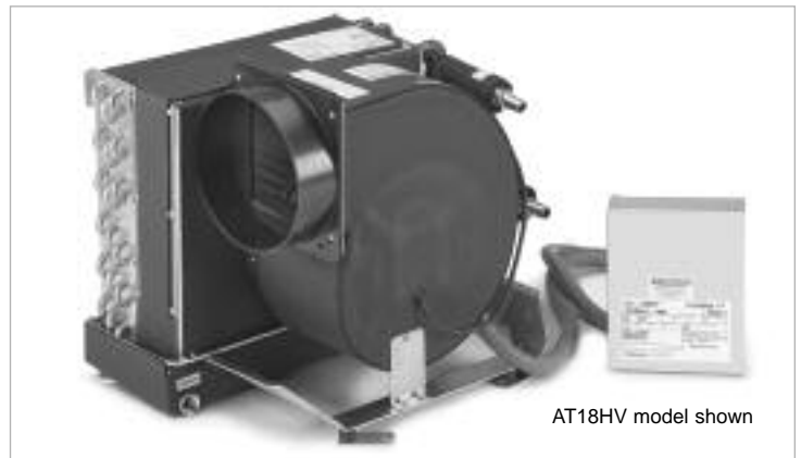
AT18HV model shown