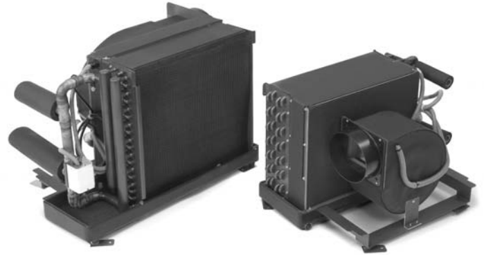
ATMU 36 and ATMU 24 models shown