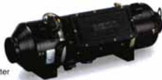
D8LC air heater