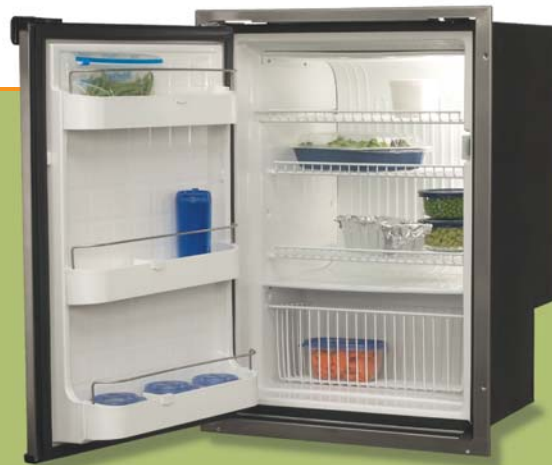
Photo above shows right hand opening door