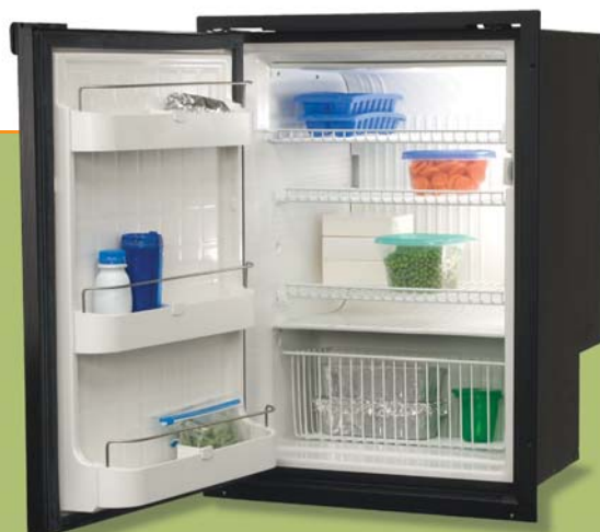
Photo above shows right hand opening door