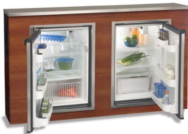
TJF42-RT-SS Freezer & TJ42RE Refrigerator Only, Shown in a galley side by side application.

All models offer a number of refinements and improvements in the door and latch assembly. The doors and shelving systems are exceptionally strong. The latch system has been designed to withstand extraordinarily rough treatment and to resist accidental opening. When heavily weighted with drinks, the latch keeps the door securely closed, even in a severe seaway. The shelves are locked but moveable, and will not come out accidentally under rough conditions. The doors are easily adapted for either left-hand or right-hand opening.